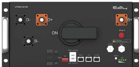
38.4V LFP Module Controller: LFP38H-C32-INT