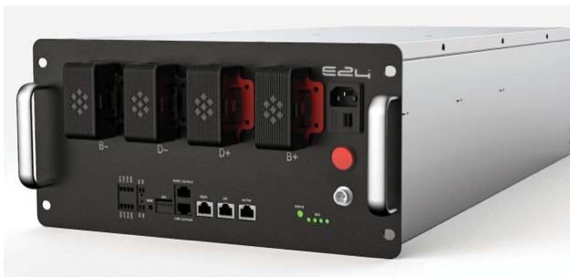
38.4V LFP Module Controller: LFP38H-C32-EXT

Up to 32 HV Battery assemblies can then be connected in parallel through a hub: LFP38-H32 in order to reach the desired energy Storage capacity.